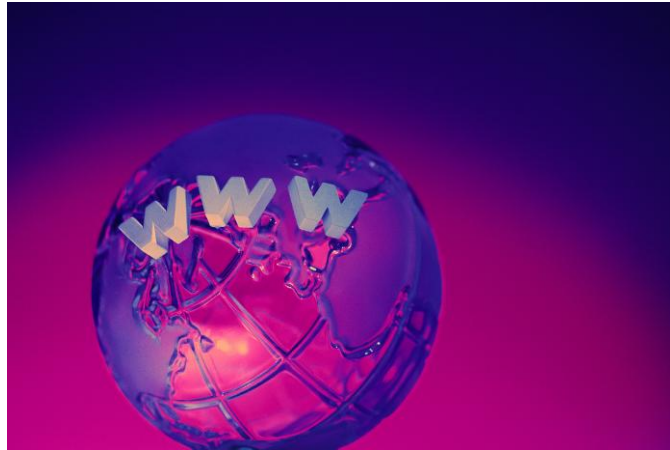
Figure 1. Figure captions are indented 5 spaces and justified. If you are familiar with Word styles, you can insert a field code called Seq figure which automatically numbers your figures.

Figures are centered. Use or insert .jpg, .tiff, or .gif illustrations instead of PowerPoint or graphic constructions. Captions go below figures. Either center or indent 5 spaces from left margin and justify.